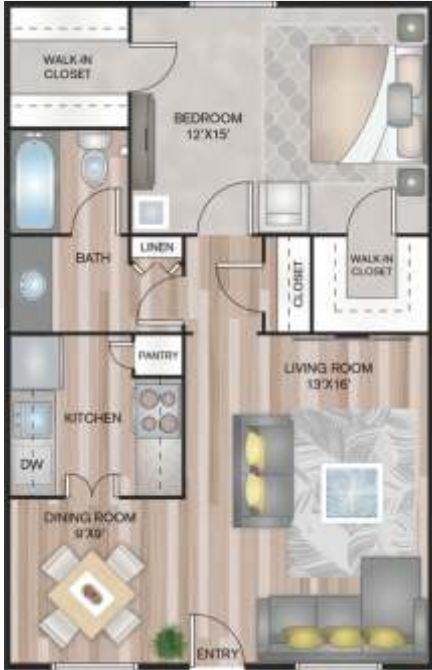
A1 1 Bed / 1 Bath 714 Sq. Ft.*