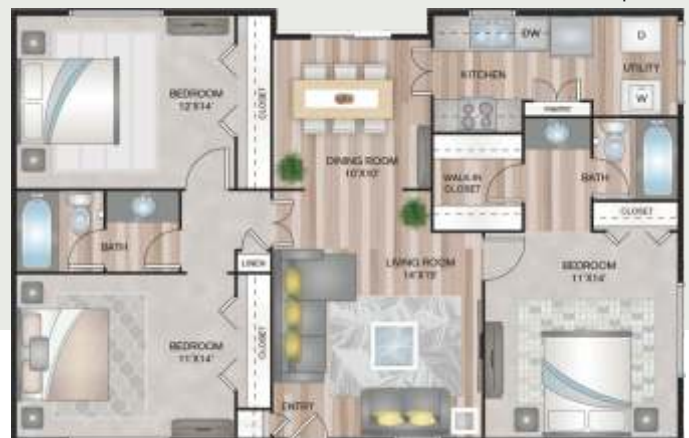
C1 3 Bed / 2 Bath 1,270 Sq. Ft.*