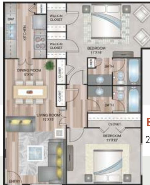
B4 2 Bed / 2 Bath 998 Sq. Ft.*