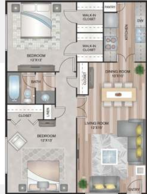
B2 2 Bed / 1 Bath 877 Sq. Ft.*