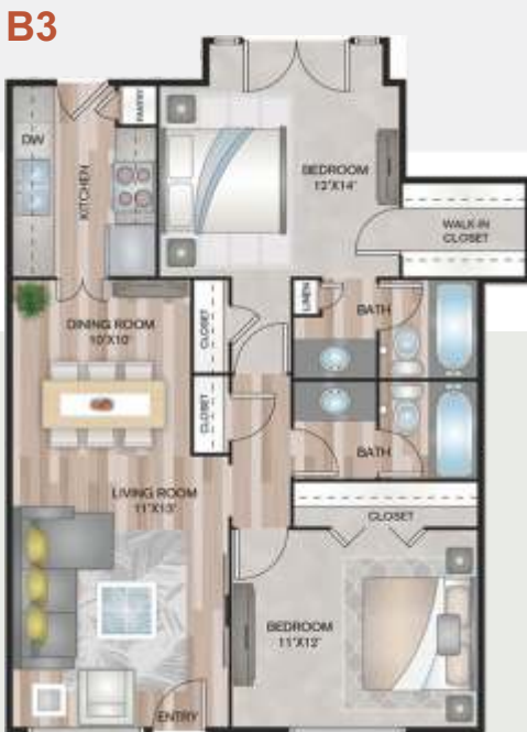
2 Bed / 2 Bath 996 Sq. Ft.*